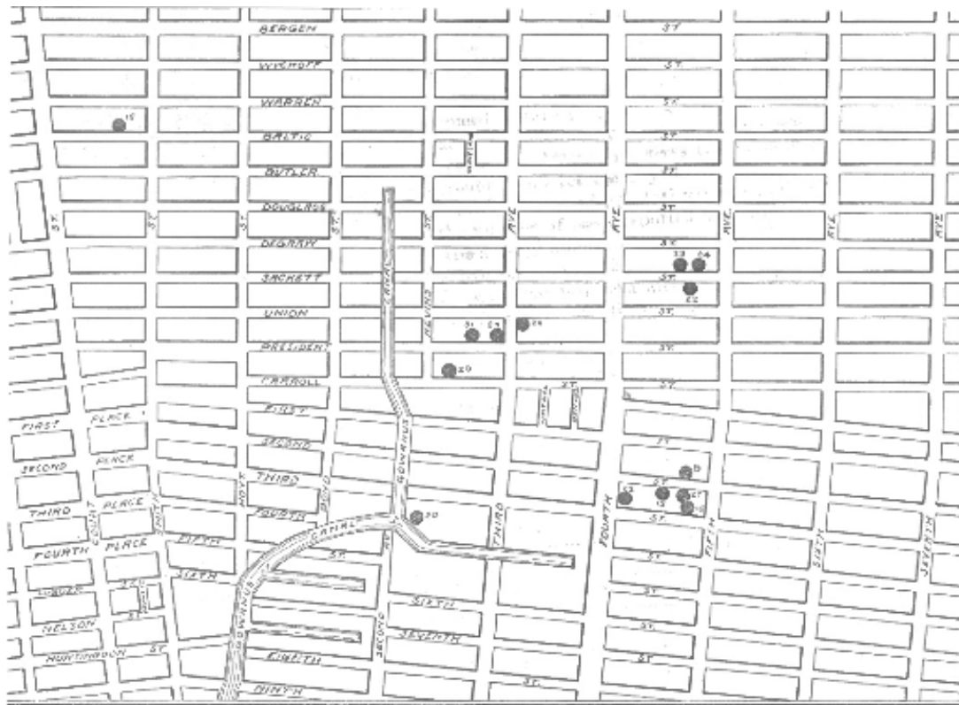
No. 16.—Polioepidemic, New York City, 1916. Map of district where epidemic began in Brooklyn, showing incidence of cases during month of May. Notes: (a) Cases indicated by dots; (b) numbers above dots refer to day of month (May) on which cases occurred. 17146-18. (To face page 87.)